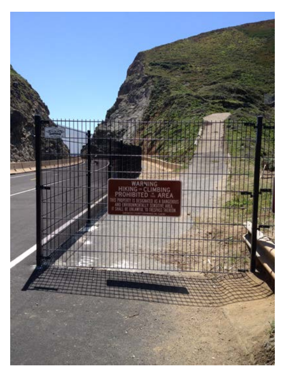
View of current fencing designed to prevent access to Bunker Hill

Additionally, the cliff area adjacent to the fence has a guardrail -- as opposed to "K-rail" utilized on the majority of the Trail – which is large enough for children to crawl under it and fall down the cliff. Although originally designated for K-rail, park officials indicated that existing guardrail was used as a cost saving measure in this area.