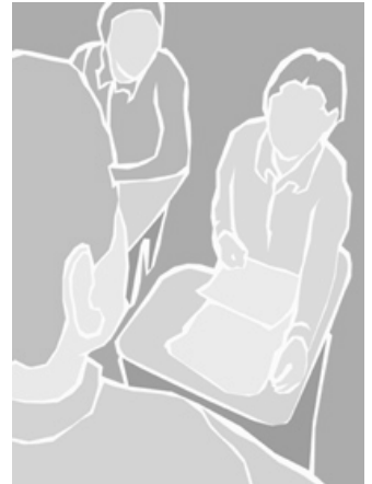
Class tours provide a real life glimpse into the criminal justice system.