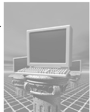
The case study is based on an actual criminal case from San Mateo County.

Go to the Court's website, at www.sanmateocourt.org , and click on High School Case Study.