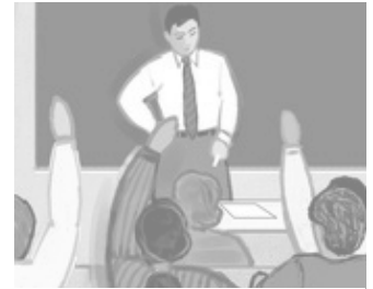
Judges in the classroom add to the learning experience by sharing real life examples that illustrate the academic material.

This year, our judicial officers went to the following schools as part of Court in the Schools Day: